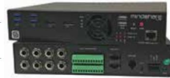
BACK VIEW —