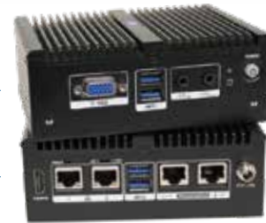
BACK VIEW —